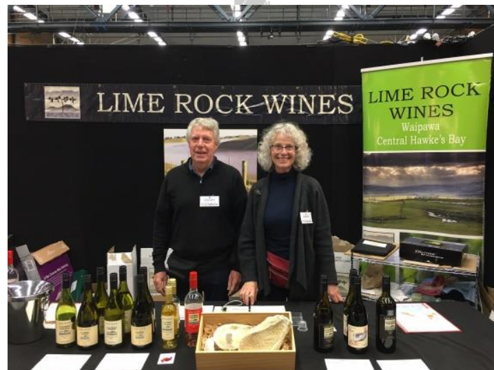
Tauranga Seriously Good Food Show 2021

We will keep the website up-to-date with our news and tastings Keep eyes peeled for HB Winegrowers 'outings'! Do keep in contact. We have had some mighty good times and look forward to many more.